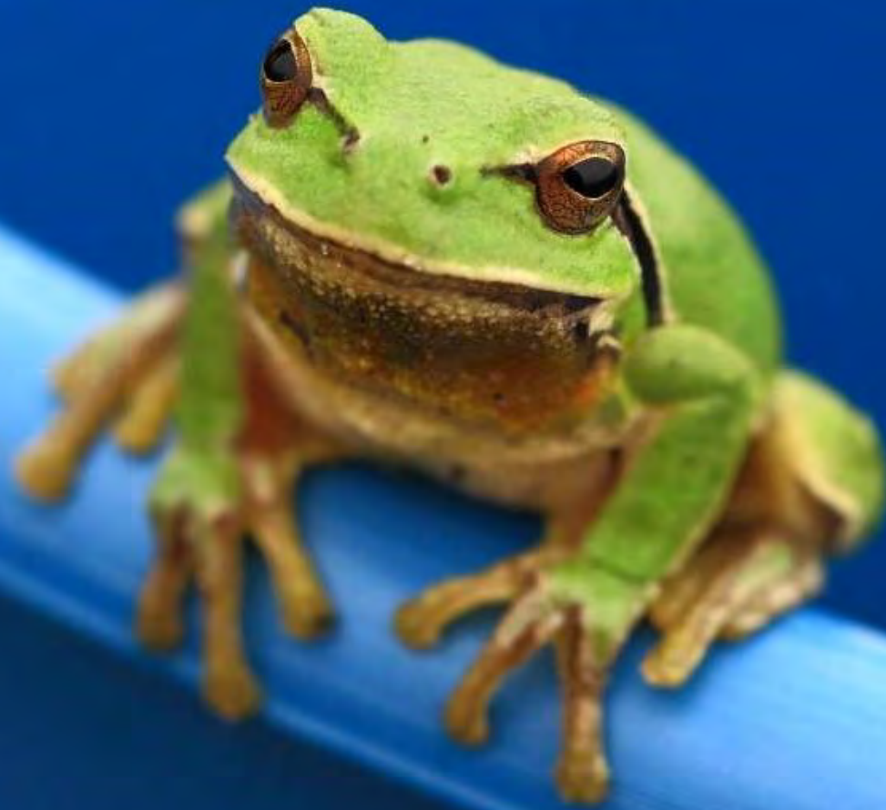
GREEN TREE FROG