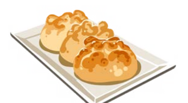
Khachapuri (Georgian recipe)