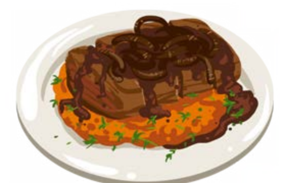
Kombo & kuot (South Sudanese recipe)