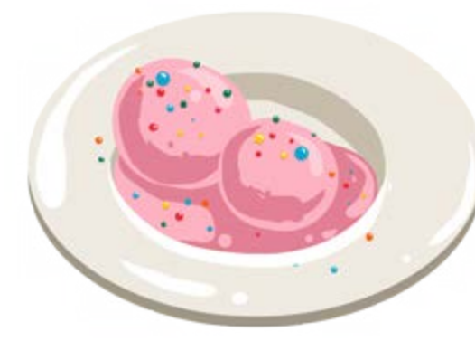
Mixed berries ice cream