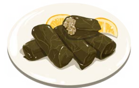
Dolmades (Greek recipe)