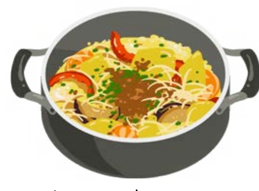
Somlor machou kroeung (Cambodian recipe)