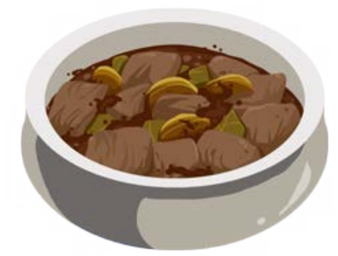
Kangaroo stew (Aboriginal recipe)