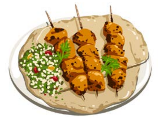
Shish taouk (Lebanese recipe)