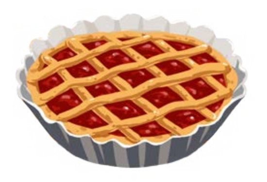
Pasta frola de mi madre (Argentinean recipe)