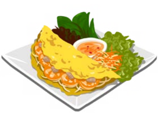
Bánh xèo (Vietnamese recipe)