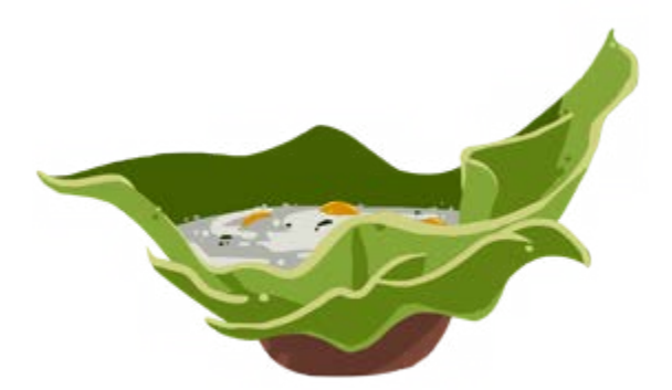
Palusami (Samoan recipe)