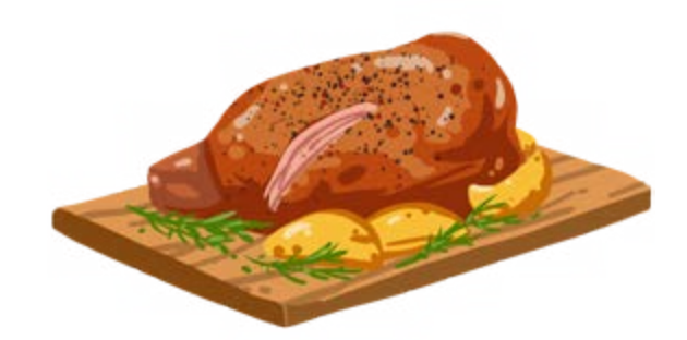
Mum's roast lamb (Outback Australian recipe)