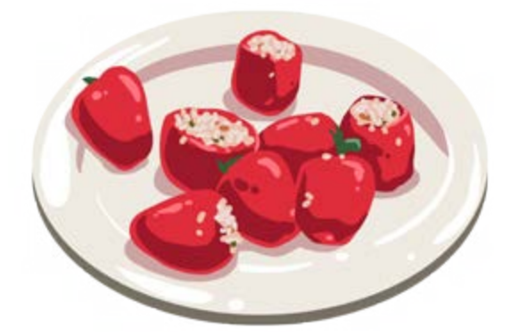
Dolma (Turkish recipe)